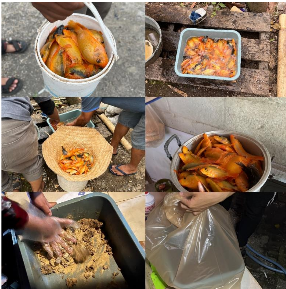
Figure 1. Red Devil Fish Processing

Based on the feed manufacturing process that has been carried out, Red Devil Fish that have been steamed and ground have a very fishy smell. Apart from that, fermented Red Devil Fish meat can attract groups of flies. This is caused by fermented food which is very suitable as a breeding ground for flies and as a food source for flies (Putri, 2019).