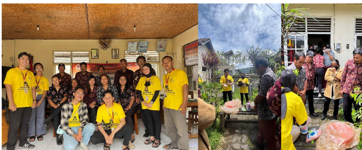
Figure 1. Socialization activity

Based on the results of the satisfaction index rate form, it can be seen that participants were satisfied with the implementation of the socialization with an average score of 4. However, there was 1 aspect that was below 4, namely regarding the material presented. The material presented received a score of 3.9 or quite satisfactory. This is due to less effective communication and delivery by researchers and the use of scientific terms that have not been simplified, so that simplification of scientific terms is needed to make the audience's understanding greater (Baaden et al., 2018). Moreover, the use of effective communication in outreach activities is necessary so that the information conveyed can be well received by the audience (Bâlc, 2018; Kamaruzaman et al., 2022).